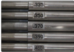
▲ Hosel bore fit

5 of the most common tip sizes are included in the kit: .335, .350, .370, .395 and .410