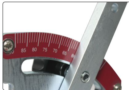
▲ Lie angle scale offers good resolution and can be easily controlled when setting up.