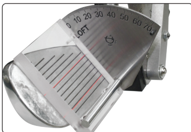
▲ Measures loft

The Tournament gauge is a good conversation starter and is ideal for initiating casual fitting sessions with potential prospects. The Tournament gauge is for right handed clubs only.