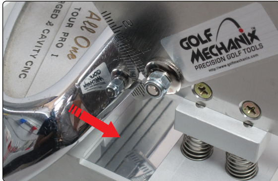
▲ Mirror allows easy alignment between groove and sliding plate

A must-have tool for custom fitting short irons, specialty wedges, and utility clubs. Measures bounce, sole width and leading edge height. Compact design with magnetic base. Easy to use. Accurate to within 0.5 degrees.