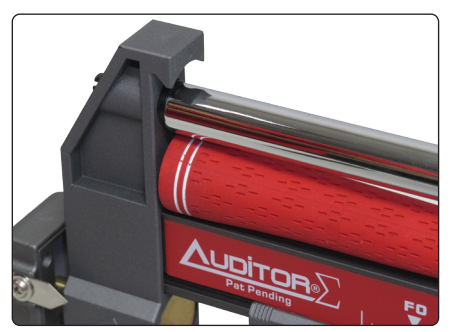
▲ Swing weighing gripless clubs with the built in grip cap compensator