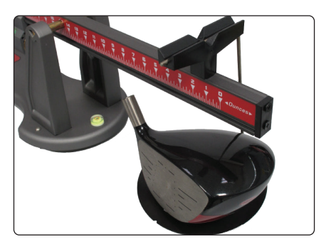
▲ Weighing club components in both grams and ounces to industry standard tolerances.