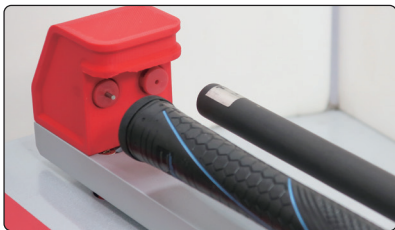
▲ Dual configuration grip back stop with built in grip cap compensator for grippless pre-assembled clubs and repeatable measurements.