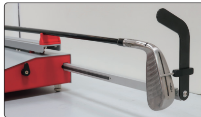
▲ Iron length measured from 28~39 inches. Straight forward indexing of the sole tangent point.