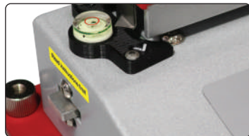
▲ External laser adjustment