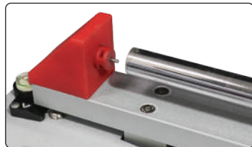
▲ Grip cap compensator for matching grip-less clubs