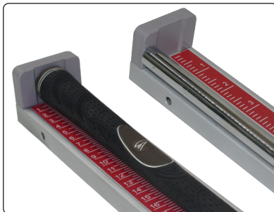
▲ Grooves on butt-stop for measuring both raw shafts and gripped clubs.