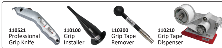
110521 Professional Grip Knife