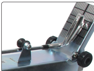
▲ Adjustable pressure speed clamp with centred rubber V-jaws