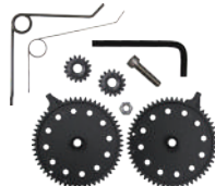
Metered Gear set kit