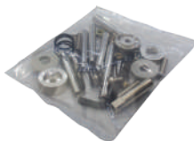
Pins and screws kit