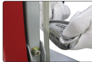
▲ Remove minor scratches and restore luster to worn out clubs