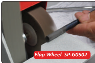
Flap Wheel SP-G0502