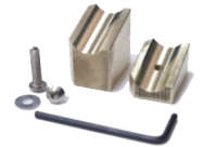
150610-SK1 Brass top jaw for 150610