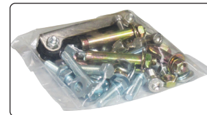
▲ Fasteners supplied