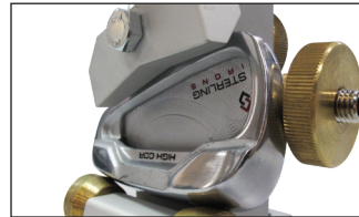
▲ Non marring kinematic clamping arrangement support the clubhead with adequately for alterations