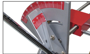
▲ Precision reference protractor for lie and loft provide accuracy to with 0.5 degree.