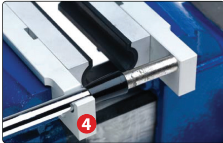
▲ Cleats double up as ferrule setter and hosel stopper.