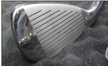
▲ Non slip alveolar foam padding support head during the curing process