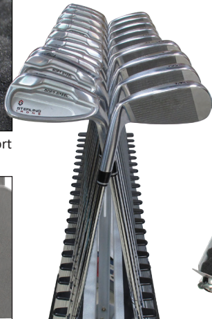
▲ Two rows of clubs can be displayed back to back