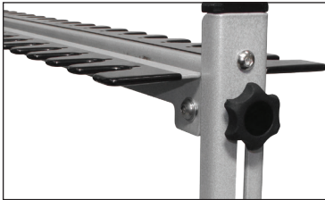
▲ PVC coated height adjustable rack

The cart ships flat with all the accessories needed for self assembly.